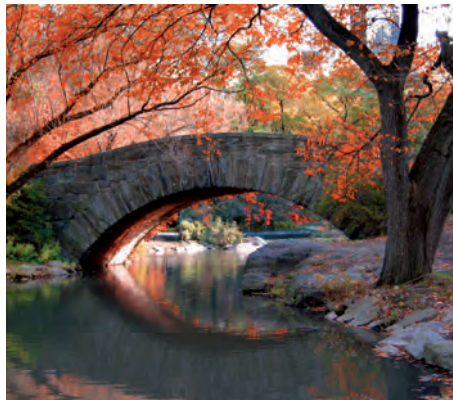
Central Park, New York

ORION are offering a free flight over the unique Bungle Bungles and up to 15% saving. Prices from $8190 per person. And when you book Orion with Armadale Travel you earn Qantas frequent flyer points. NOW THAT'S CRUISING!