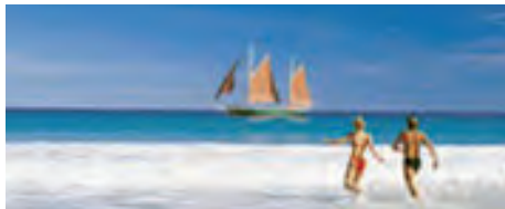
Cable Beach, Broome